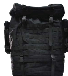
BAG PACK FRONT VIEW