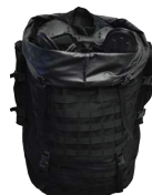
BAG PACK FRONT VIEW WITH ANTI RIOT SUIT INSIDE