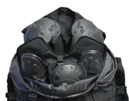
BAG PACK UPPER VIEW WITH ANTI RIOT SUIT INSIDE