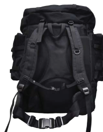
BAG PACK BACK VIEW